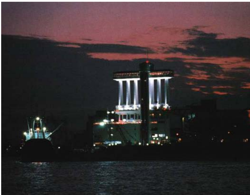
Design Competition, Uchi Murase (Architect)