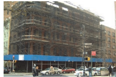
Project Name: Gramercy House Location: New York, New York