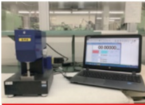
Contact outer diameter measuring instrument (Union Tool)

We are pursuing the Unitech quality using various measuring equipment. We offer sub-micron quality to our customers.