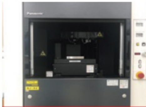
Ultrahigh accurate 3-D profilometer (Panasonic)