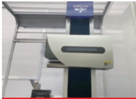
Shape measuring machine (Tokyo Seimitsu)