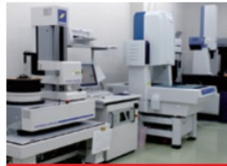
Roundness measuring machine (Tokyo Seimitsu)