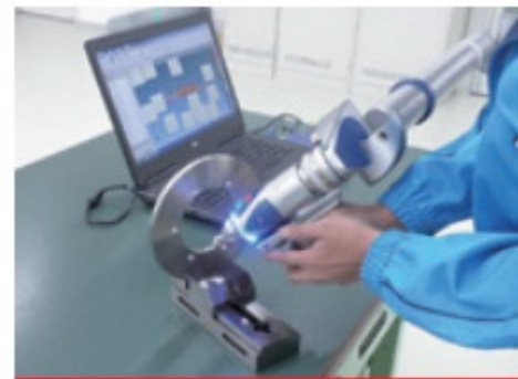
FARO portable 3D measuring instrument (FARO)