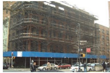
Project Name: Gramercy House Location: New York, New York