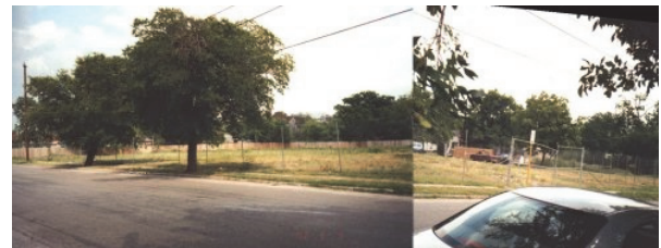
Project Name: Villas del Norte Location: San Antonio, Texas