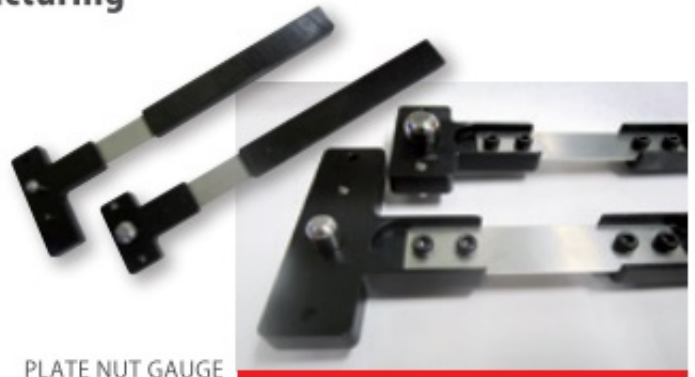
PLATE NUT GAUGE

Special gauge to inspect crashed diameter and height of fastener (rivet) at civil aircraft manufacturing lines