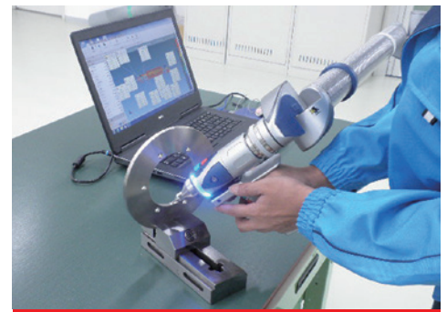
FARO portable 3D measuring instrument (FARO)