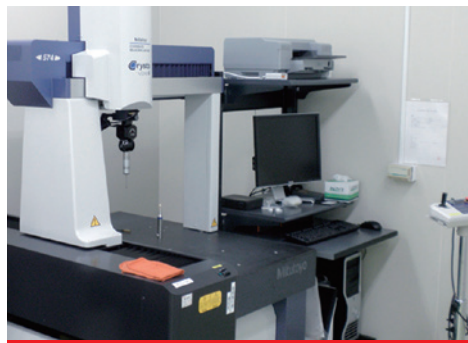
3D coordinate measurement machine (Mitutoyo)