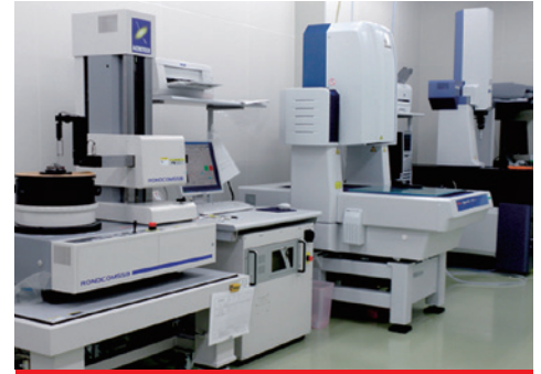
Roundness measuring machine (Tokyo Seimitsu)