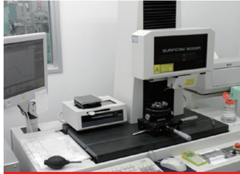
Shape measuring machine (Tokyo Seimitsu)